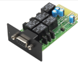
AS/400 Card Datasheet: Link Item No.: 10120515