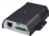
EMD for SNMP Manager Environmental Monitoring Device Monitor Temperature & Humidity Datasheet: Link Item No.: 10120544