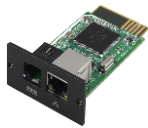
SNMP manager Datasheet: Link Item No.: 10120505