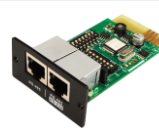
Modbus Card Datasheet: Link Item No.: 10120565