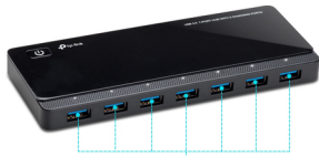
High Data Transfer Speed with USB 3.0 Ports