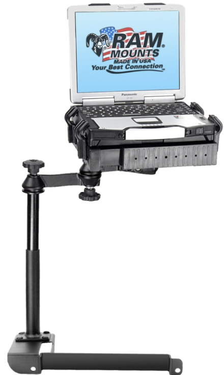
Shown In Use