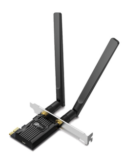
Bluetooth 5.2 Compatible

TP-Link AX1800 Wi-Fi 6 Bluetooth 5.2 PCIe Adapter. Internal. Connectivity technology: Wireless, Host interface: PCI Express, Interface: WLAN / Bluetooth. Maximum data transfer rate: 1800 Mbit/s, Top Wi-Fi standard: Wi-Fi 6 (802.11ax), Wi-Fi band: Dual-band (2.4 GHz / 5 GHz). Product colour: Black