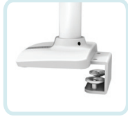
WHITE UNDER-MOUNT C-CLAMP ACCESSORY 98-083: ATTACHES TO SURFACE EDGE