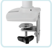
INCLUDED: STANDARD 2-PIECE DESK CLAMP ATTACHES TO SURFACE EDGE