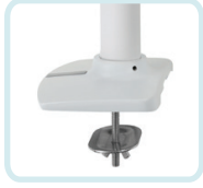
WHITE GROMMET MOUNT KIT ACCESSORY 98-034: ATTACHES THROUGH SURFACE HOLE