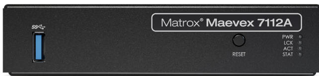
Maevox 7112A (AVC), front view