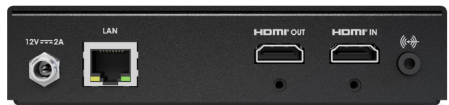
Maevox 7112A (AVC), back view

Maevox 7112H features a similar form factor to 7112A