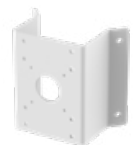
0070-11861 Corner Mount