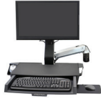
SV Combo Arm with Worksurface and Pan