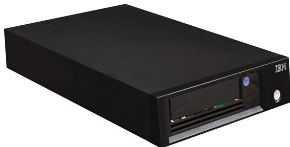
Figure 3. TS2250 Tape Drive for Lenovo

The following figure shows the TS2250 Tape Drive.