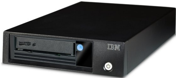
Figure 2. TS2260 Tape Drive for Lenovo

The following figure shows the TS2260 Tape Drive.