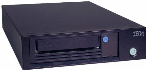
Figure 1. TS2270 Tape Drive for Lenovo

The LTO Ultrium Tape Drives from Lenovo are excellent choices if you use tape drives that require larger-capacity or higher-performance tape backup. The TS2270, TS2260, and TS2250 Tape Drives are an excellent choice for tape backup solutions for Lenovo System x® and ThinkServer® servers.